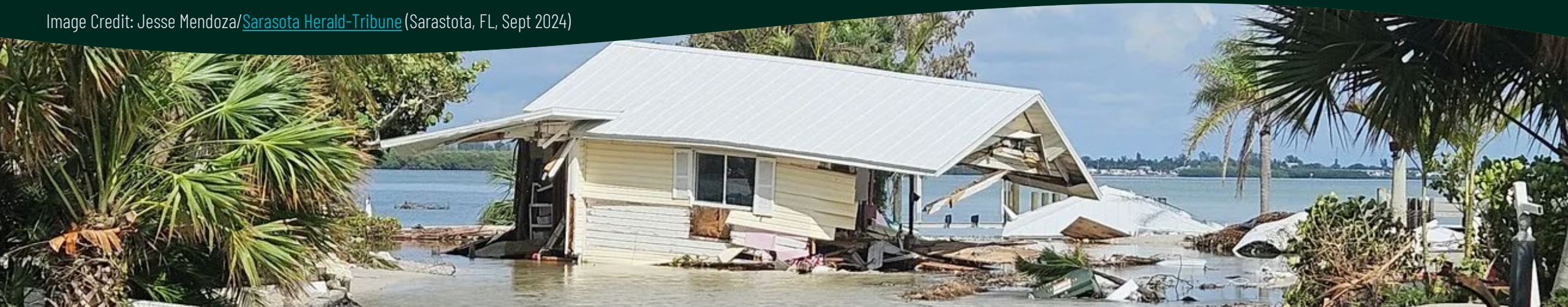
Image Credit: Jesse Mendoza/ Sarasota Herald-Tribune (Sarasota, FL, Sept 2024)