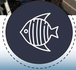
Coastal Community Resilience