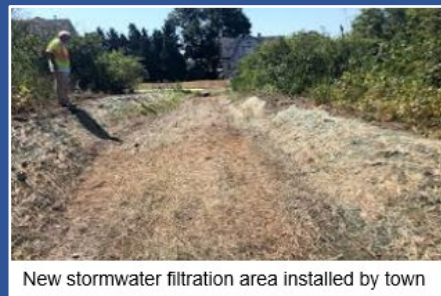
New stormwater filtration area installed by town