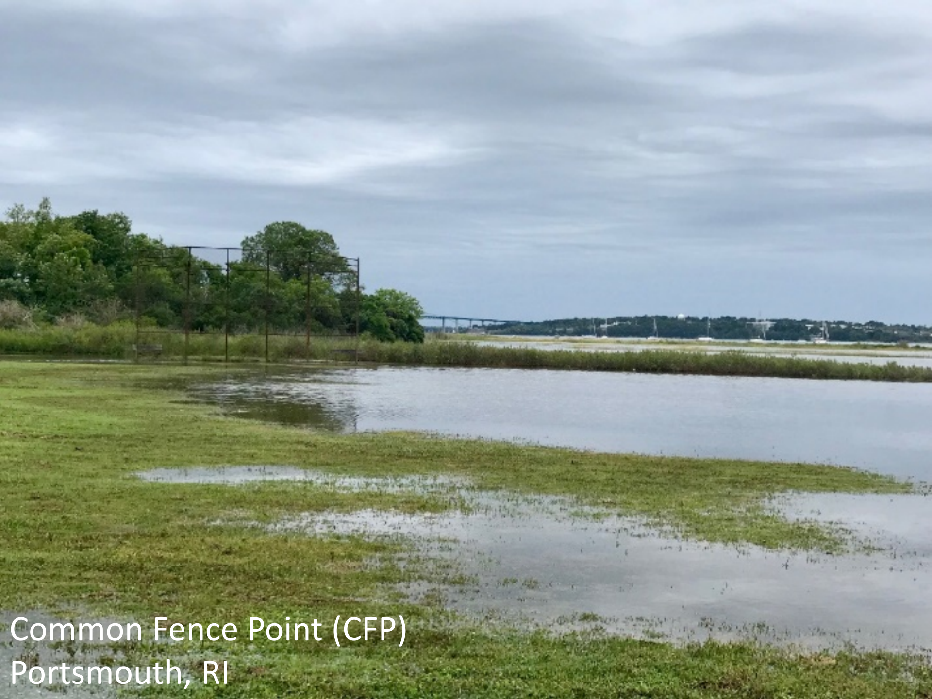
Common Fence Point (CFP) Portsmouth, RI