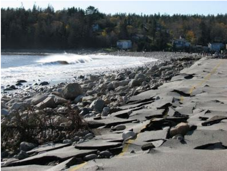
Queensland Beach washout